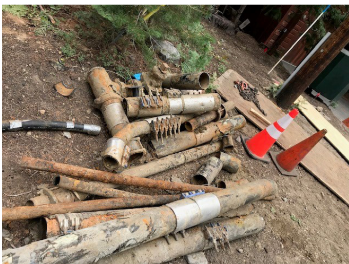
Above: Undersized and failing water pipes from the Tahoe Cedars Water System.

In addition, you may receive project updates and communications directly from Granite-DOWL staff on behalf of TCPUD.